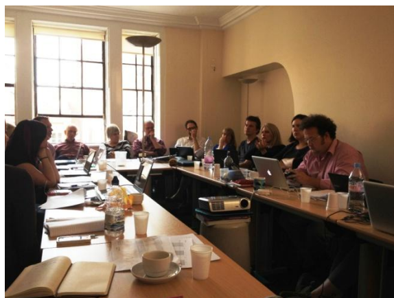
Figure 1. Meeting at the CEU, 25/26 July

The next steps include developing a formal project form for each of the people/teams to explore each project in more detail and thereafter to agree a timeline for implementation of the project