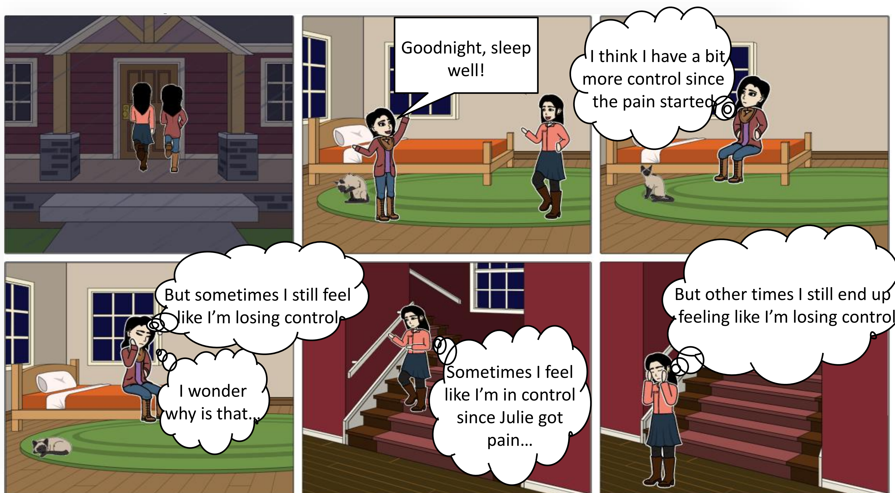
Figure 2. Example of cartoon developed to share ambiguous or controversial findings with children: